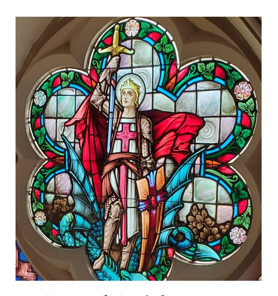
Annual Parish Report 2022