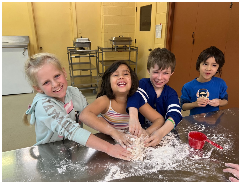
Church School students kneading pretzel dough. (February 18, 2024)

We will continue to support our university and college students with a spring mailing.