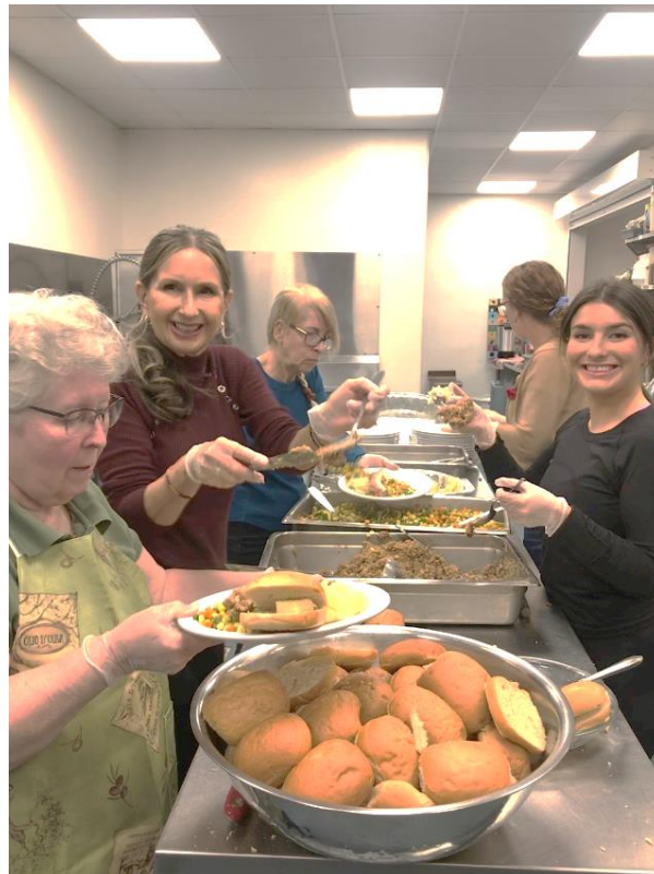
Saturday Night Suppers at Royal City Mission