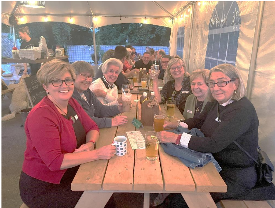
Pub Night at the Woolwich Arms

Respectfully submitted, Tracy Jewell, Bookkeeper