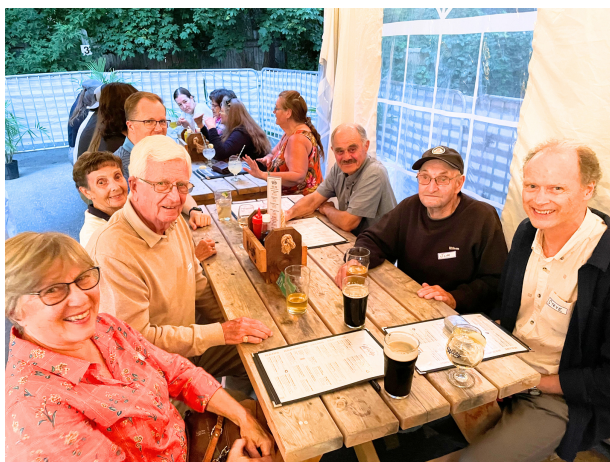
St. George's Pub Night